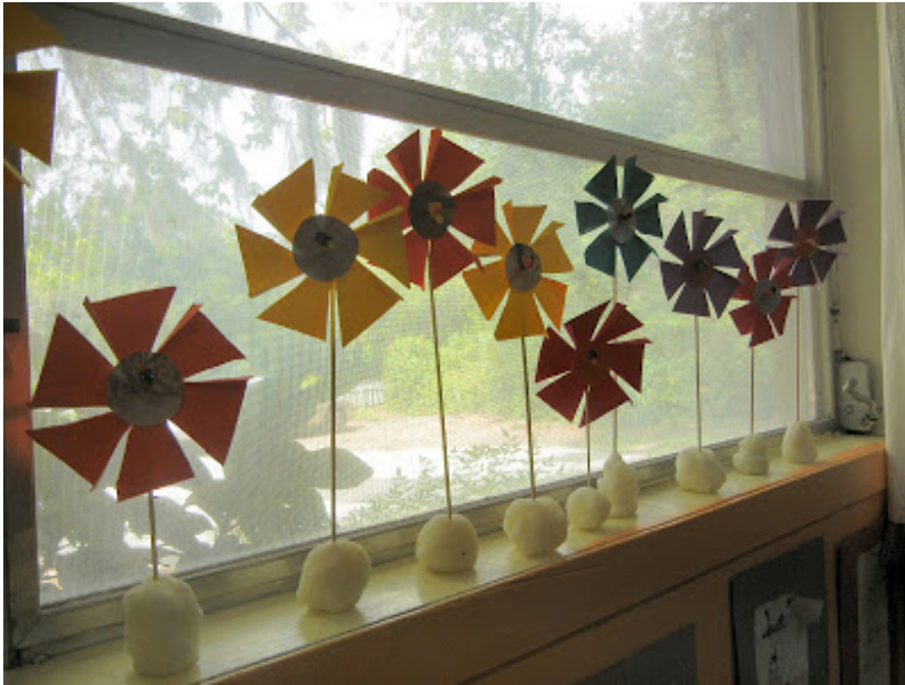
[ http://3.bp.blogspot.com/-gkp499UV7pk/UBGU09HikII/AAAAAAAAEXY/CjuQ8XAY3ow/s1600/DSCN6016.JPG ]