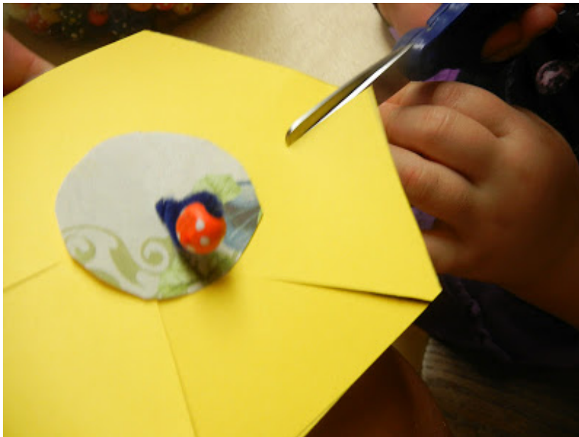
[ http://2.bp.blogspot.com/-y-h8LpyR9Ak/UBGPCfKBy7I/AAAAAAAAEVw/RwbnHQNCWVo/s1600/DSCN5948.JPG ]