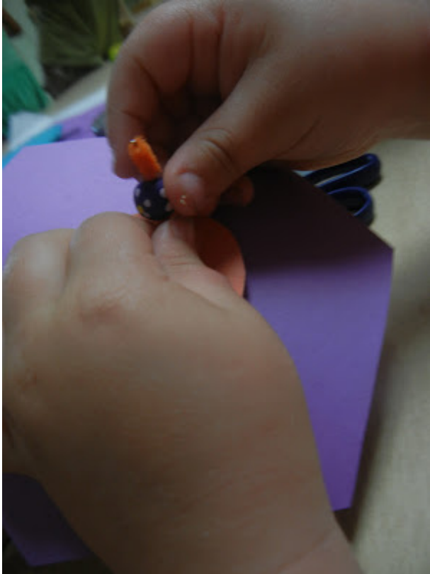
[ http://4.bp.blogspot.com/-4d5uUB-2R8w/UBGQmpMZyul/AAAAAAAAEWQ/Q0kpfuS8To/s1600/DSCN5957.JPG ]